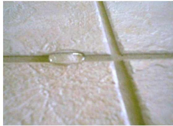
Above: Photo demonstrating water beading on sealed grout line

As you can see from the graphics above, sealed surfaces do not allow penetration of liquids that can become permanent. Protect your hard surfaces today, for a fraction of the cost of replacement, you won't be sorry!